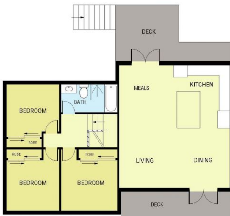
TOP & MID FLOOR